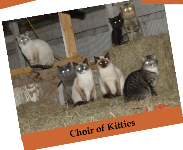
Choir of Kitties