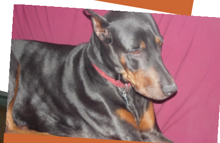
Pig Ears, Please Santa