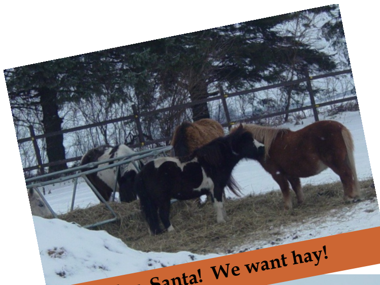
Hey, Santa! We want hay!

Let's share Christmas Spirit – Please enjoy these photos!