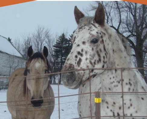
Was that Santa?