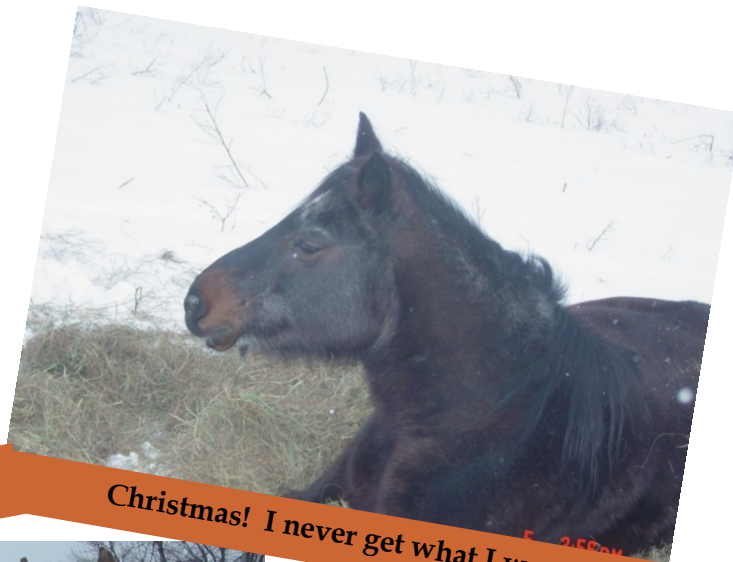
Christmas! I never get what I want!