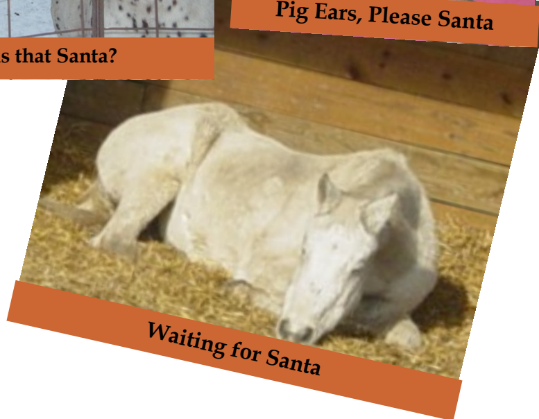
Waiting for Santa

Check out our new home page at www.misfitacres.com and help decorate the Horse's Christmas Tree!!