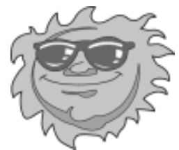
Summer is a neat time of year for Misfit Acres

know. We try to stay fairly local with these activities since five of the Sanctuary Horses of Misfit Acres need meals 3 times a day. We also try to avoid holiday weekend functions.