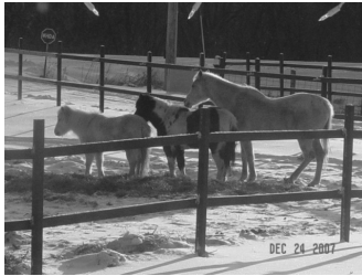
They are each loving the warmer temperatures.

The Sanctuary Horses of Misfit Acres are all doing well!! They are each one loving the warmer temperatures. Dixie and Abbey, being white, look like mud balls! Abbey, Dixie, and