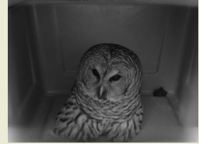
... to tell us he had found an owl in the middle of the road with a wing injury ...

the wing. When his treatment is all done, the Center strongly encourages the bird be released at or near where he was found. We are making plans to pick up the owl - named Tumbleweed by our son - and release him back in the wild as soon as the Raptor Center gives us the go ahead. What a wonderful day that will be!!