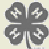
We are looking forward to another fun & busy day with the members and chaperones.