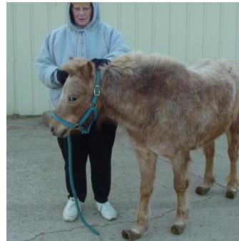
Misfit Acres Littlest Angel